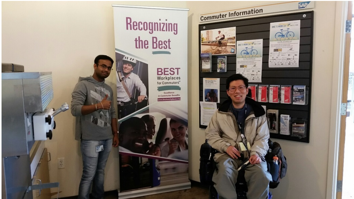
Commuters pose with the BWC Banner at SAP Labs, LLC in Palo Alto, California

Best Workplaces for Commuters members entered their application to receive a FREE 6-foot pop-up banner to display at events or in their lobby to promote Best Workplaces for Commuters. To be considered for one of the free banners, members submitted an entry describing how the banner would be used to promote Best Workplaces for Commuters and agreed to post pictures of the banner in action on social media. Congratulations to the following recipients, your banner is on its way and can't wait to get to work!