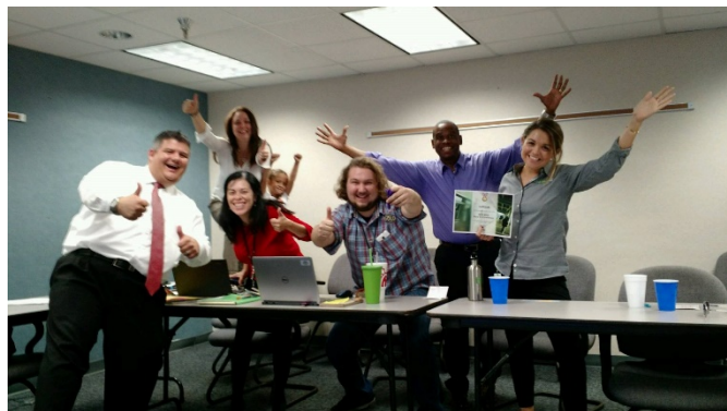
reThink employees show their excitement when they find out they won "Best Of" Supporting Agencies