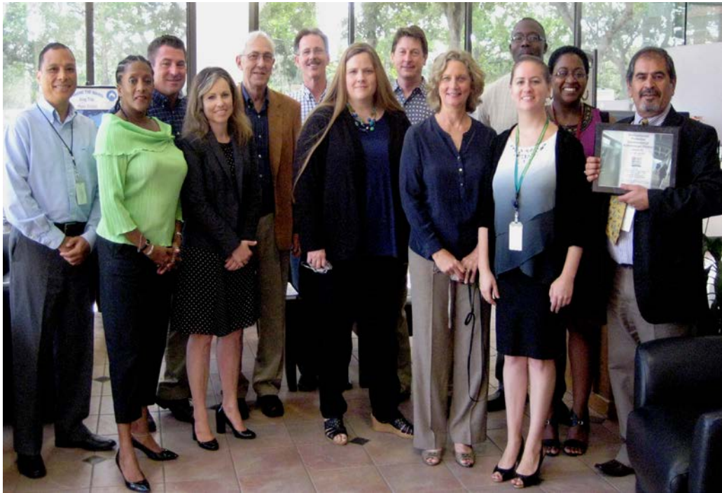
EPC, TBARTA, and BWC staff in the BWC Designation Ceremony